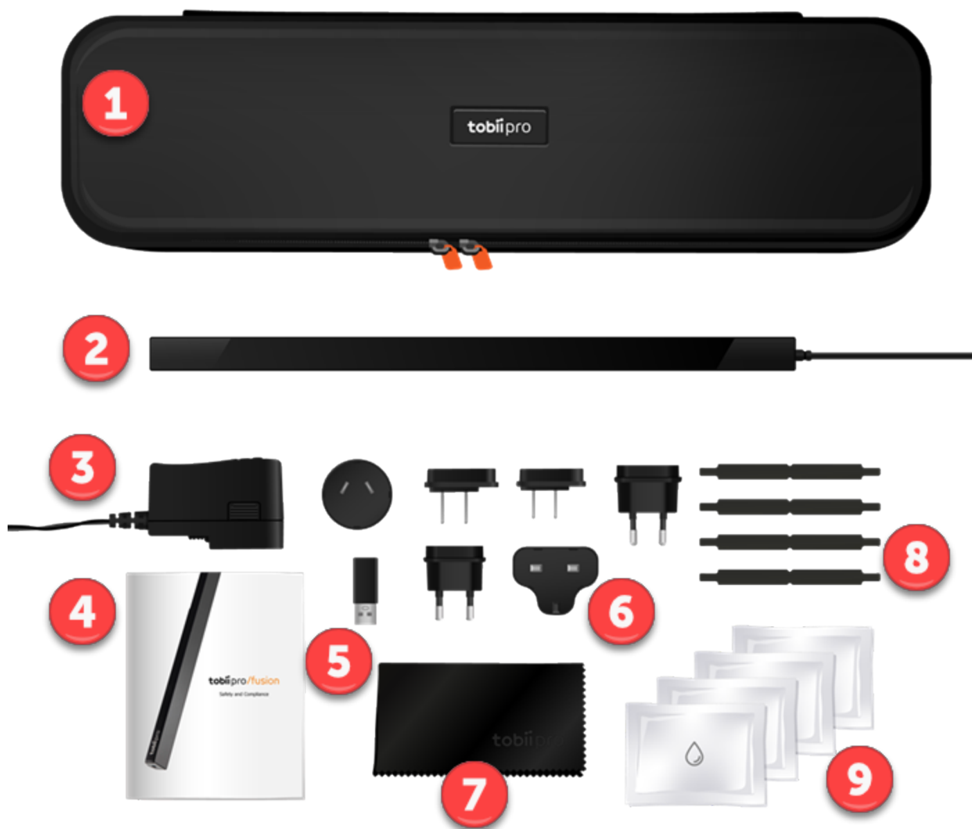
Figure 2. What's in the Pro Fusion box